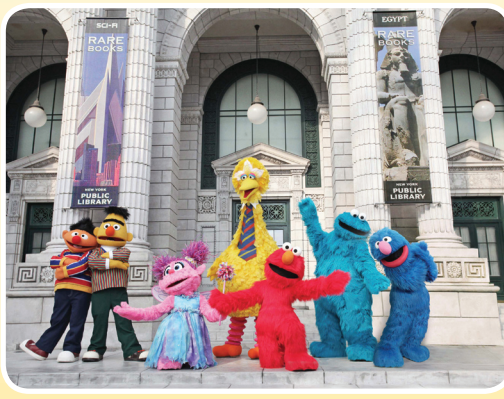
Sesame Street Show - When I Grow Up