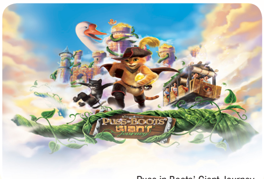
Puss in Boots' Giant Journey

*Guests must be at least 122cm in height to ride. Children of 100cm to 122cm must be accompanied by a supervising companion. This ride employs safety restraints which may not accommodate certain people due to their body shape or size.