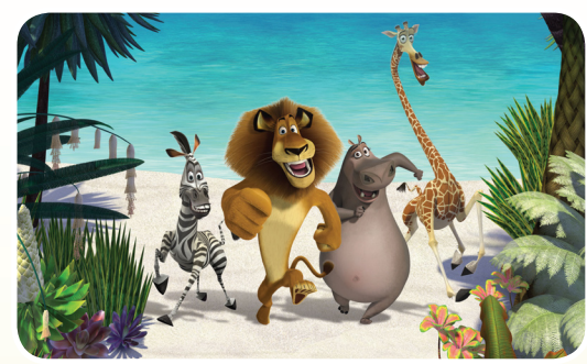
Madagascar: A Crate Adventure