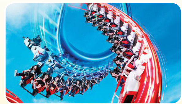
Battlestar Galactica: HUMAN vs. CYLON

*Guests must be at least 125cm in height. This ride employs certain safety restraints which may not accommodate certain people due to their body shape or size.