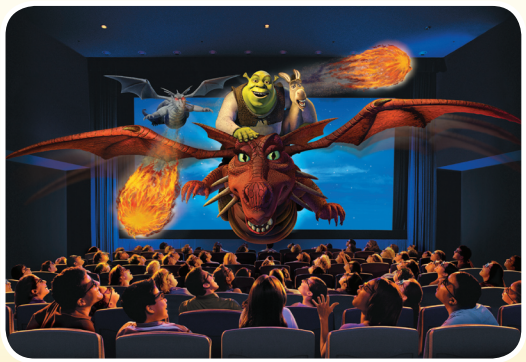
Shrek 4-D Adventure

A fantastical ferris wheel for children in Fairy Godmother's Potion Shop.