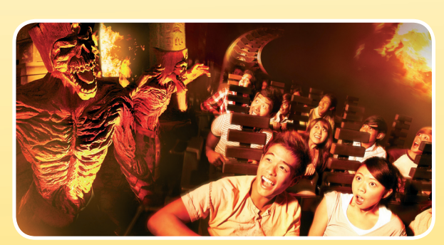
Revenge of the Mummy

*Guests must be at least 122cm in height to ride. This ride employs certain safety restraints which may not accommodate certain people due to their body shape or size.