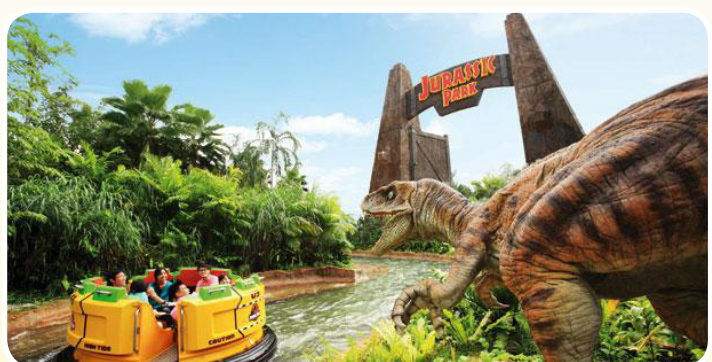
Jurassic Park Rapids Adventure

*Children under 122cm must be accompanied by a supervising companion.