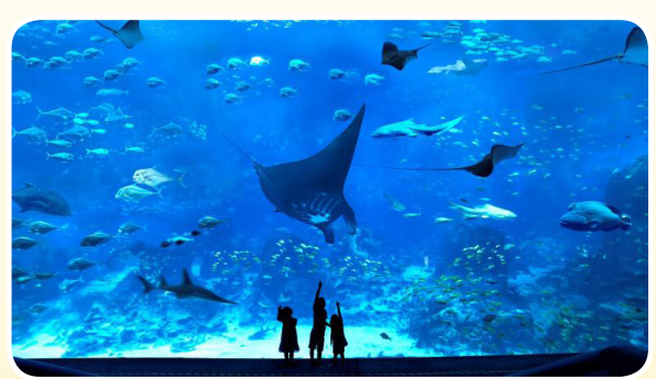
Open Ocean Gallery

Begin the journey by travelling back in time to discover Asia's maritime heritage at The Maritime Experiential Museum (MEMA). Then, enter and explore the marine realm of S.E.A. Aquarium, home to more than 100,000 marine animals over 800 species, across into 49 different habitats, each one fascinating than the next. It's an experience you will never forget.